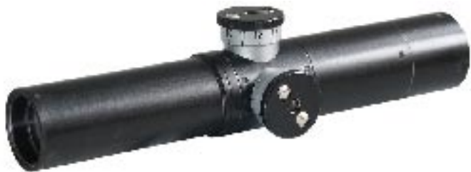
Overview of the sight